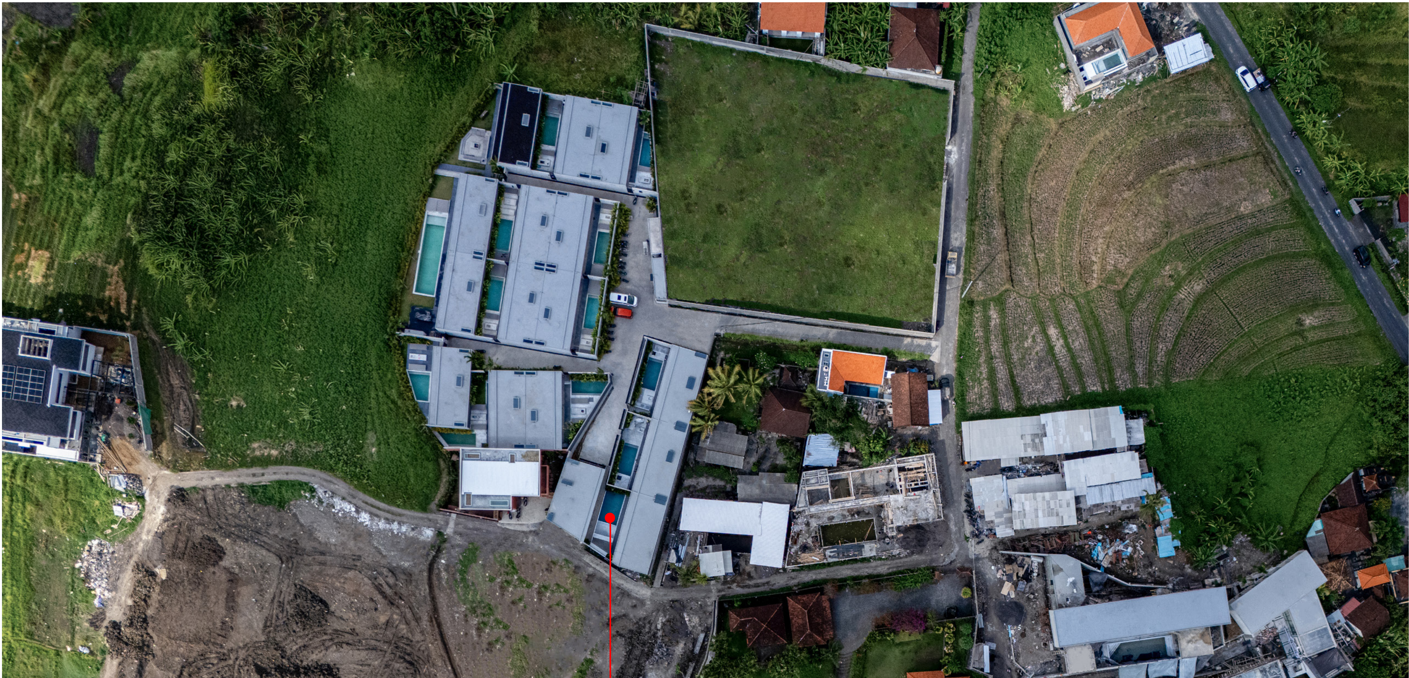
● THE AREA