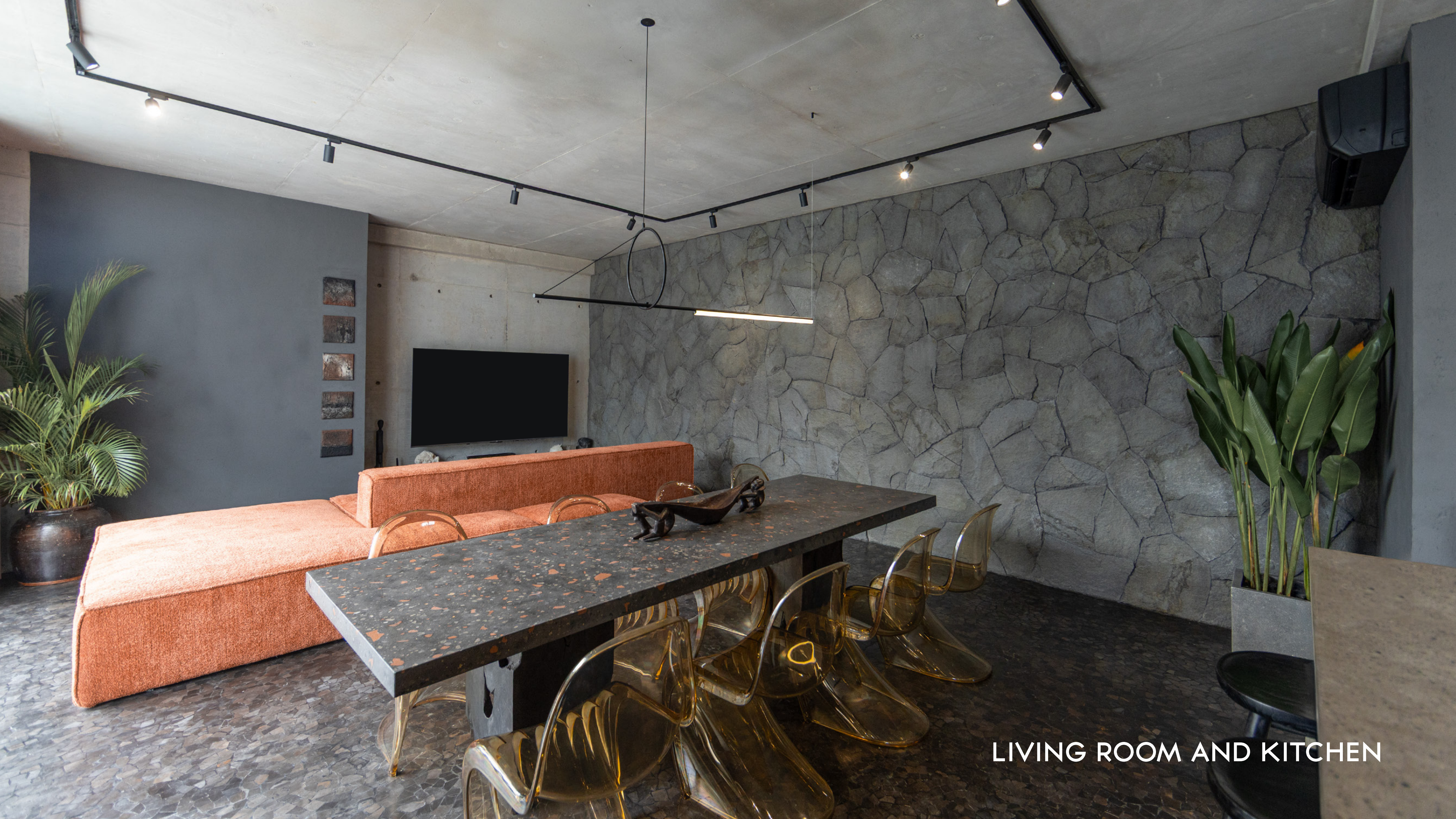
LIVING ROOM AND KITCHEN